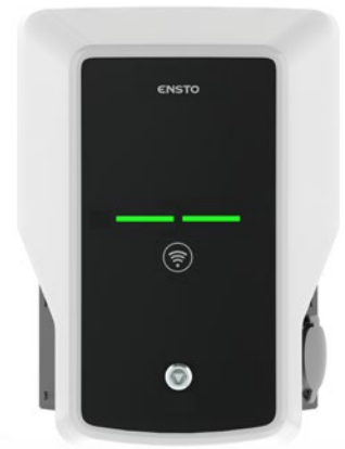
Chago Wallbox with a single socket